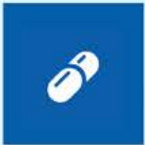
appetite suppressants (amphetamines)